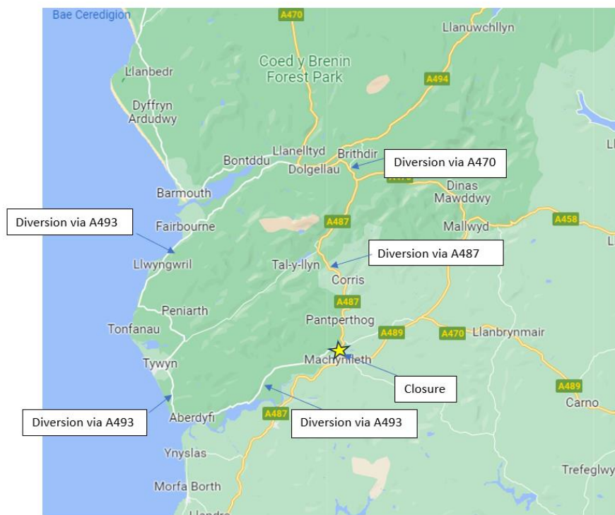
Proposed Diversion Route (A493 Closure Machynlleth)

The following signed diversion routes will be in place during the road closure: